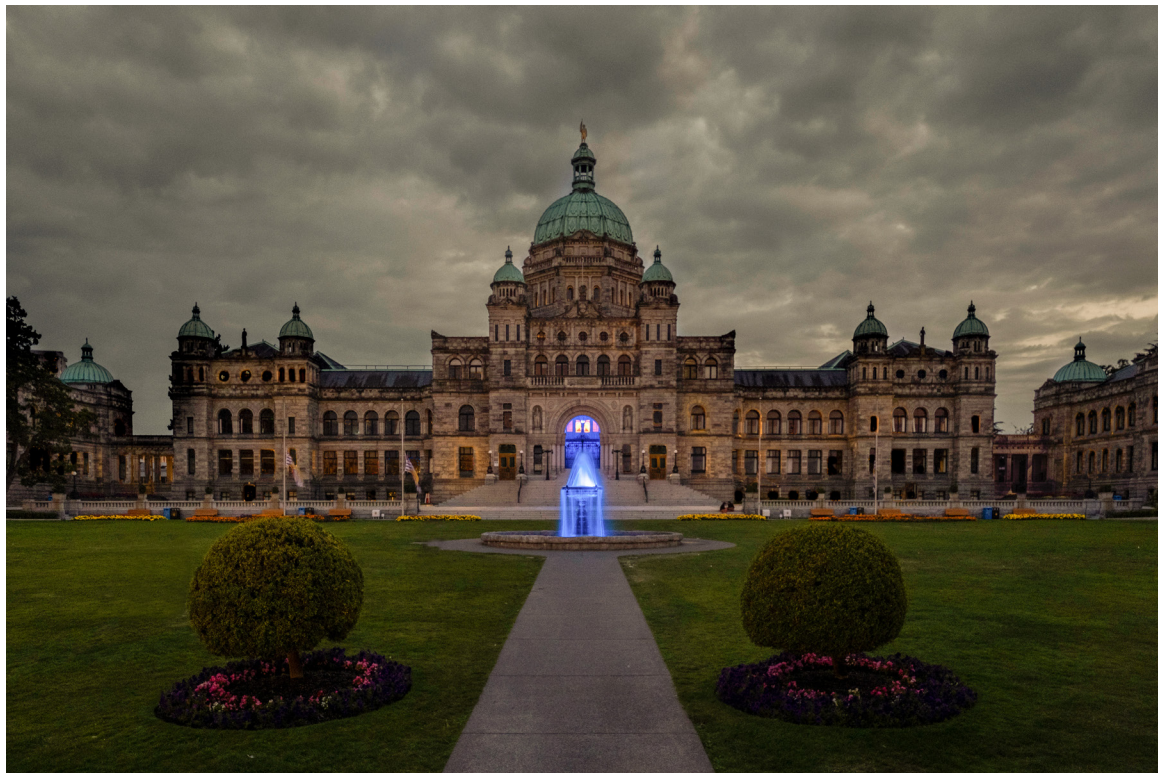
The Parliament Buildings with flags at half-mast and illuminated in royal blue as part of a nation-wide visual tribute to the Queen during the mourning period.