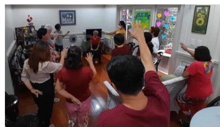
Sending out PJM staff to Uganda