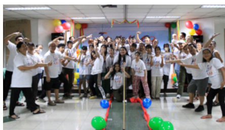
Youth Arts Camp