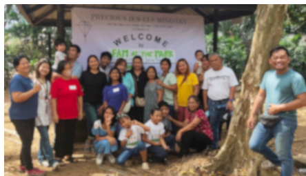
Fam at the Park