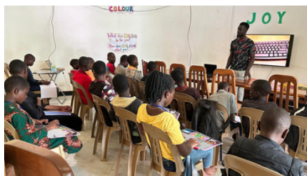
A Journey With Children in Grief