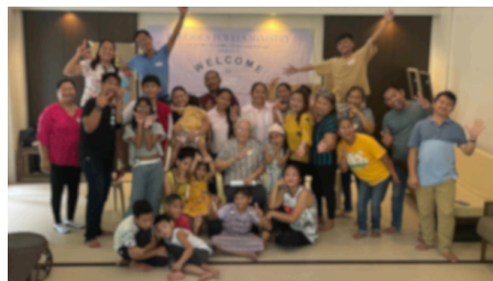
Treatment Partners Workshop (TP)